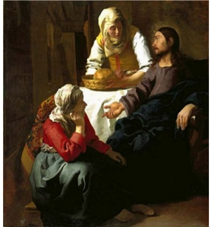
Image – Christ in the House of Martha and Mary Jan Vermeer van Delft, 1654. National Galleries of Scotland

For this reason, the story of Martha and Mary in the Gospel is an inspiration to find where and what God calls us to be more. The "better part" which Jesus seemed to commend was not that Mary was sitting before the Lord, listening intently to his teachings while Martha was up and about in her service of hospitality. No. We need prayer. We need action. Both are needed in the Church. The "better part" however which the Lord said Mary should not be deprived of, was the fact that Mary saw, Mary realized, and Mary considered the other